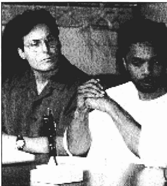
The jurors consider the matching knife, unbeknownst to the audience, a switchblade comb jammed into a piece of styrofoam.

tion a few. My combined perspective as a practitioner and researcher reinforced my deepest convictions that performance-oriented theatre in a prison environment has significant under-researched therapeutic values for participants and audience alike. Most recently, I developed and completed an empirical study that supports the hypothesis that a prisoner's social and institutional behavior is deeply impacted by participating in the intensive process of making theatre.